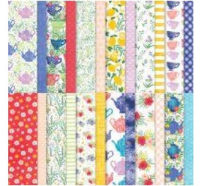
Tea Boutique 6" X 6" (15.2 X 15.2 Cm) Designer Series Paper