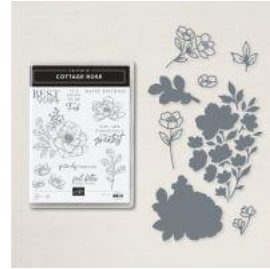
Cottage Rose Bundle (English)