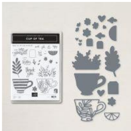
Cup Of Tea Bundle (English)