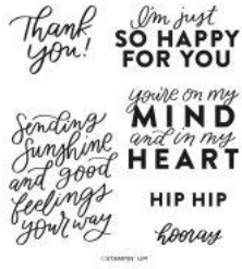
Good Feelings Cling Stamp Set (English)