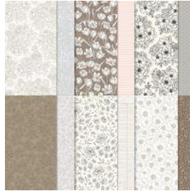
Abigail Rose 12" X 12" (30.5 X 30.5 Cm) Designer Series Paper